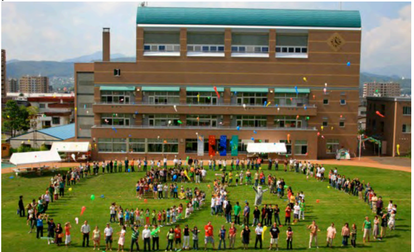
Students, parents, alumni and staff let fly balloons to celebrate H.I.S.'s 50 years of service to the international community of Sapporo during the 50th Family Day, September 13, 2008.